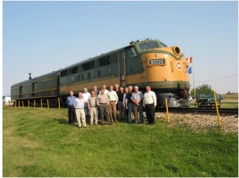
Edmonton, September 9, 2006