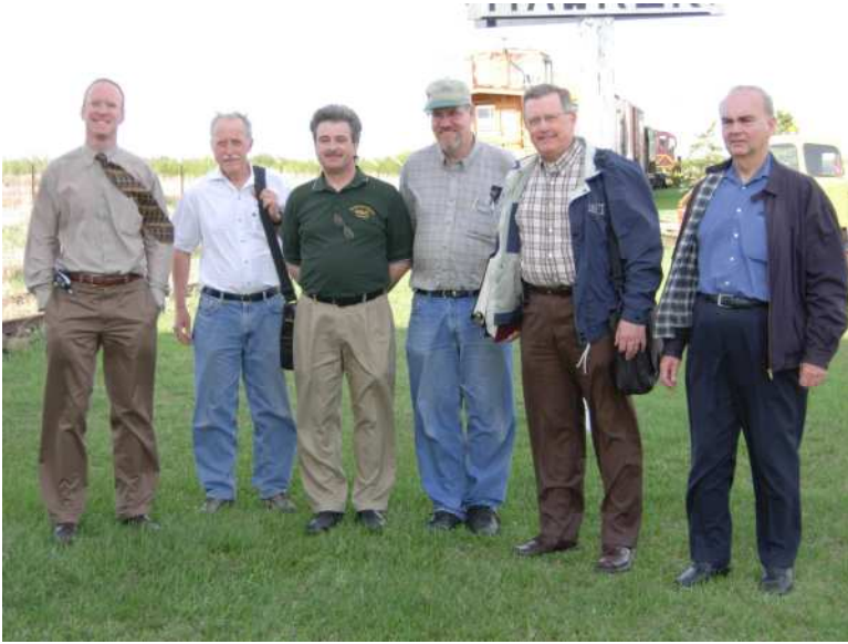
Saskatoon, May 6, 2006

Shown below are a few group portraits taken at some of our recent meetings.