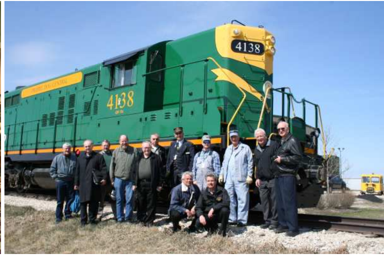
Winnipeg, May 3, 2008

Got any CCRH photos you'd like to share? Send them electronically to: