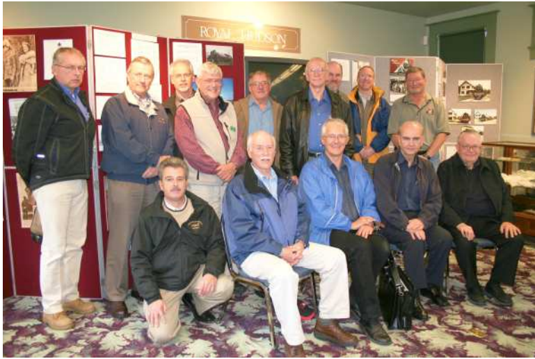
Squamish, October 20, 2007